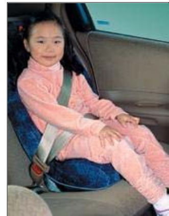
Belt-positioning booster seat