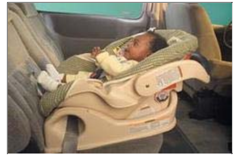
Infant-only car safety seat