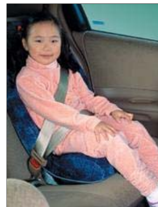
Belt-positioning booster seat