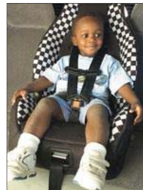
Forward-facing car safety seat

A tether is a strap that attaches to the top of a car safety seat and to an anchor point in your vehicle (see your vehicle owner’s manual to find where the tether anchors are in your vehicle). Tethers give important extra protection by keeping the car safety seat and the child’s head from moving too far forward in a crash or sudden stop. All new cars, minivans, and light trucks have been required to have tether anchors since September 2000. New forward-facing car safety seats come with tethers. For older seats, or if your tether is missing, tether kits are available. Check with the car safety seat manufacturer to find out how you can get a tether if your seat does not have one.